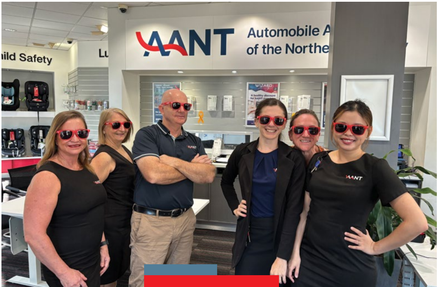
Bass in the Grass