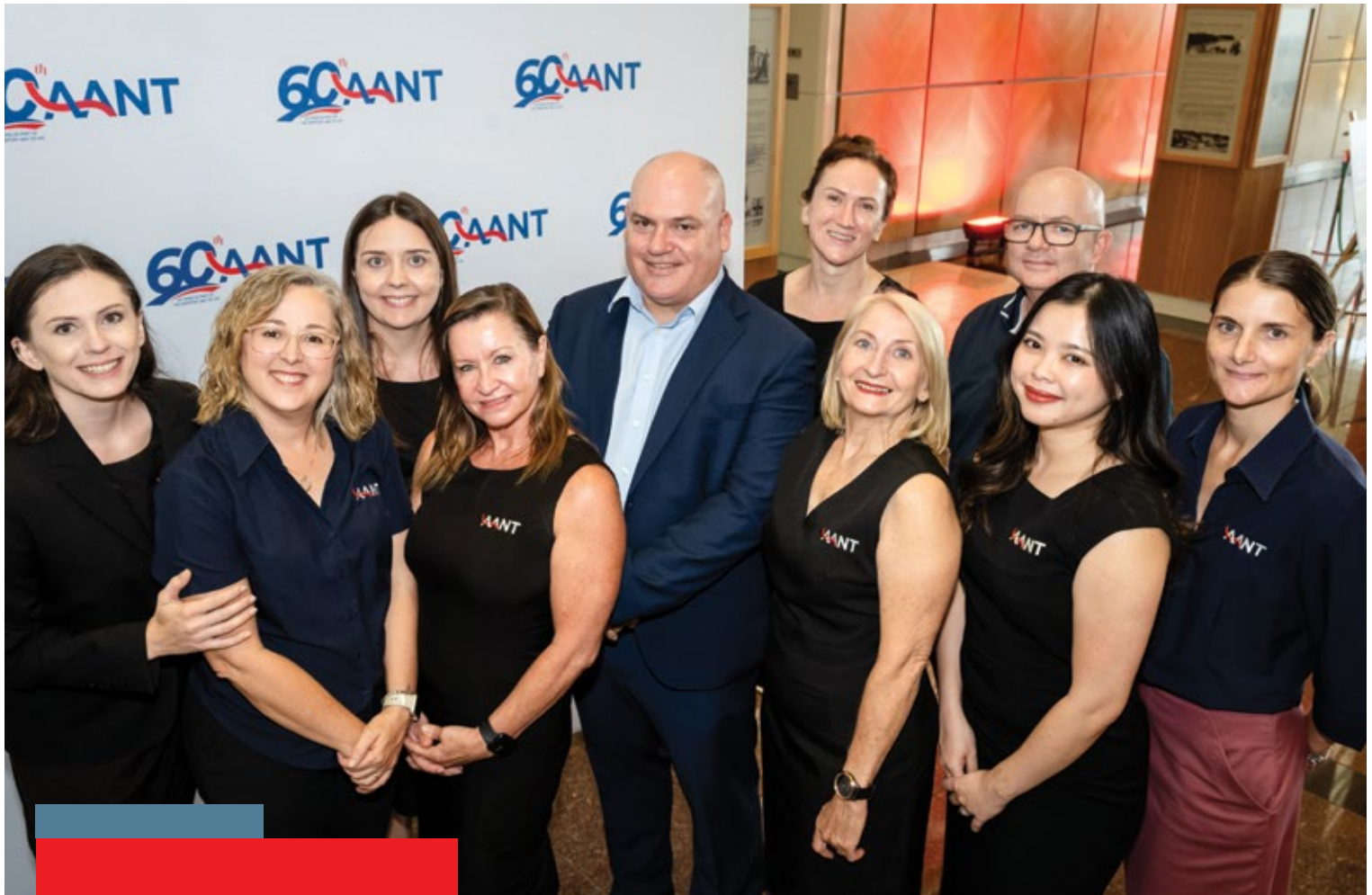
Celebrating 60 years of AANT