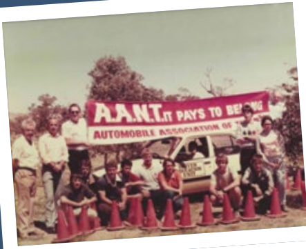
Advocating for Road Safety